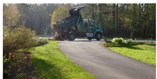
Resist the temptation to apply mulch now . Applied too early (and April is too early in Massachusetts), the mulch will slow down your garden by acting as a blanket, preventing warming and keeping the soil colder than the air. Later on, those 2 to 3 inches of mulch will keep down weeds and dress your garden.

Invasive Alert. Garlic mustard is a very invasive weed that easily outcompetes native plants. In early April, garlic mustard pulls easily – roots and all – out of the ground. Be sure to wear gloves because the sap from the plant can cause a painful, poison-ivy-type rash. Once garlic mustard flowers, each plant can produce thousands of seeds that remain viable in the soil for years.