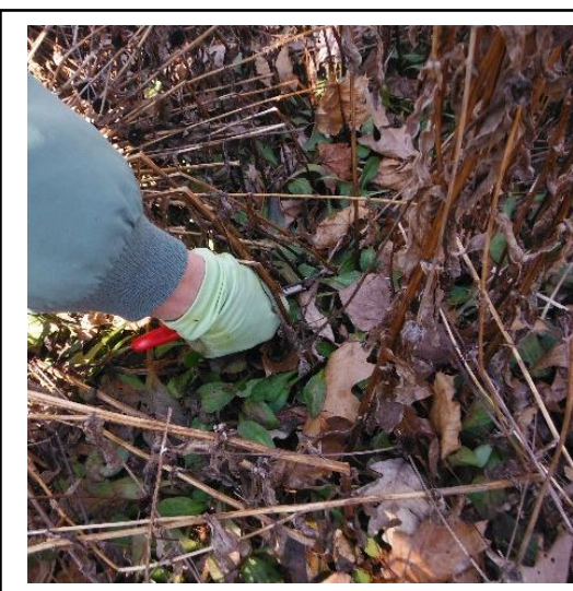
In the flower garden. Any remaining perennial tops from last year should be cut off and removed before new growth begins. A thin top dressing of compost around perennials prior to this year's bloom will enrich the soil.