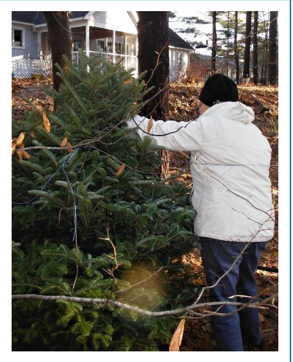
This Fraser fir was cut in December and graced a home until New Years Eve. On New Year's Day, it was tied between several trees roughly 30 feet from a set of bird feeders. It will provide refuge from predators as well as a shelter from bad weather.